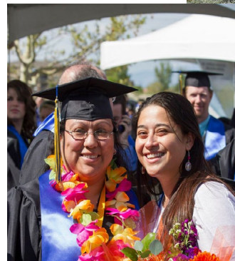
Salt Lake Community College