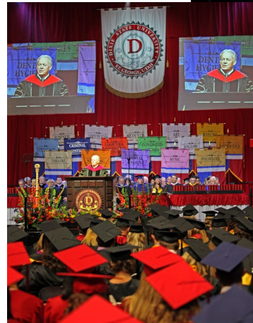
Dixie State University