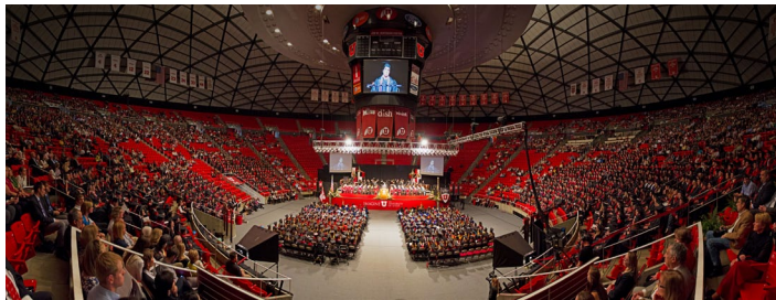
University of Utah

Utah's Colleges & Universities Award Record Number of Credentials