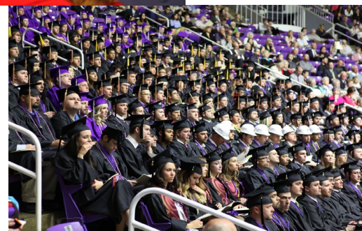
Weber State University