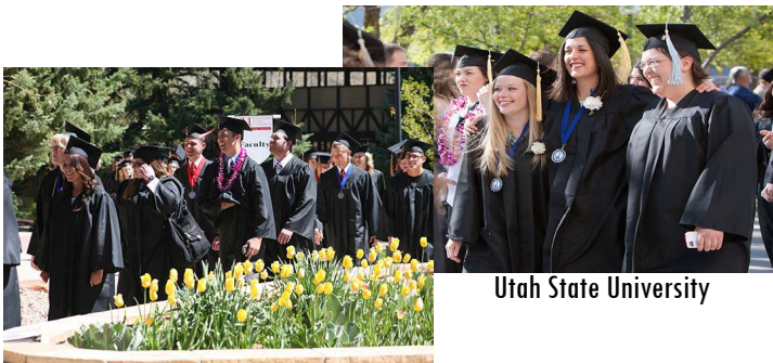
Utah State University