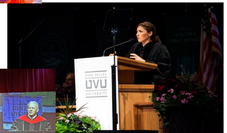
Utah Valley University