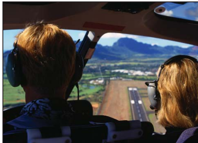
Salt Lake Community College has offered their Professional Pilot program for 16 years to prepare students for a career in the aerospace industry. The program includes classroom academics, simulator training, and in-flight instruction.