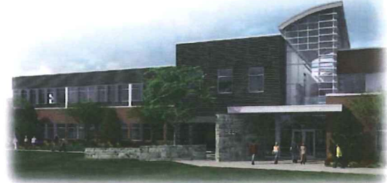
Uintah Basin Bingham Entrepreneurship and Energy Research Center