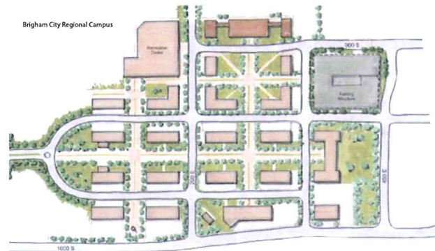
Brigham City Regional Campus