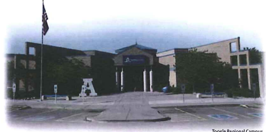
Tooele Regional Campus