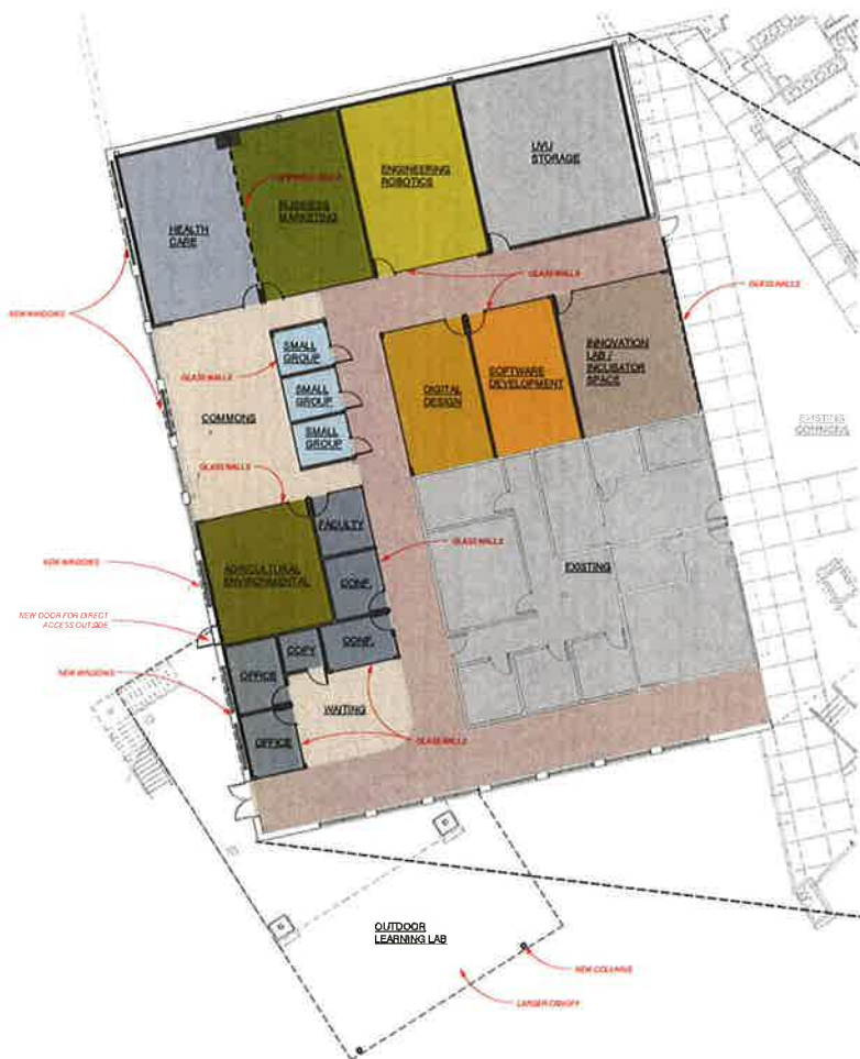
'C.A.P.S.' FLOOR PLAN