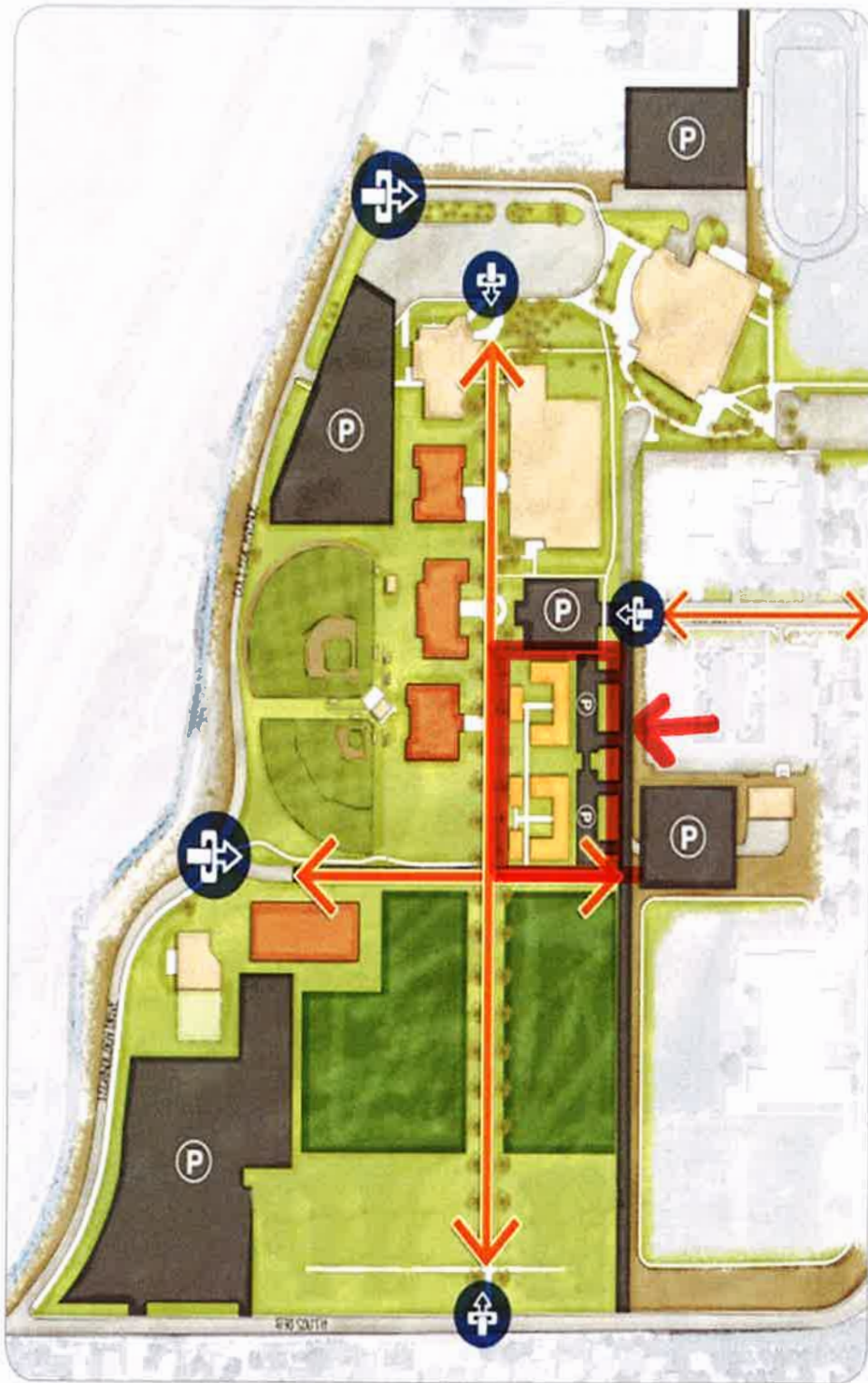
FIGURE 2-Showing the recommended location for student housing closer to the campus core with sidewalks, roads, and utilities more readily available.