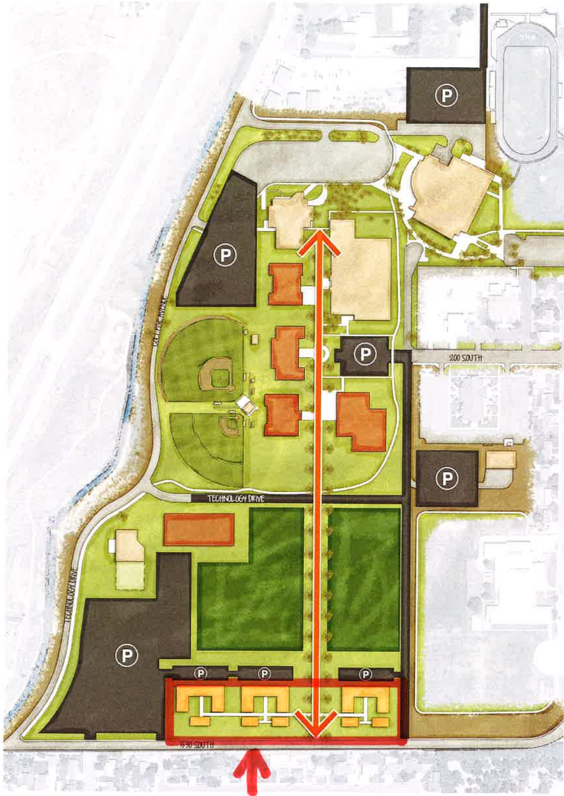
FIGURE 1- Showing the original proposed location for student housing at the far south end of the Richfield campus property.