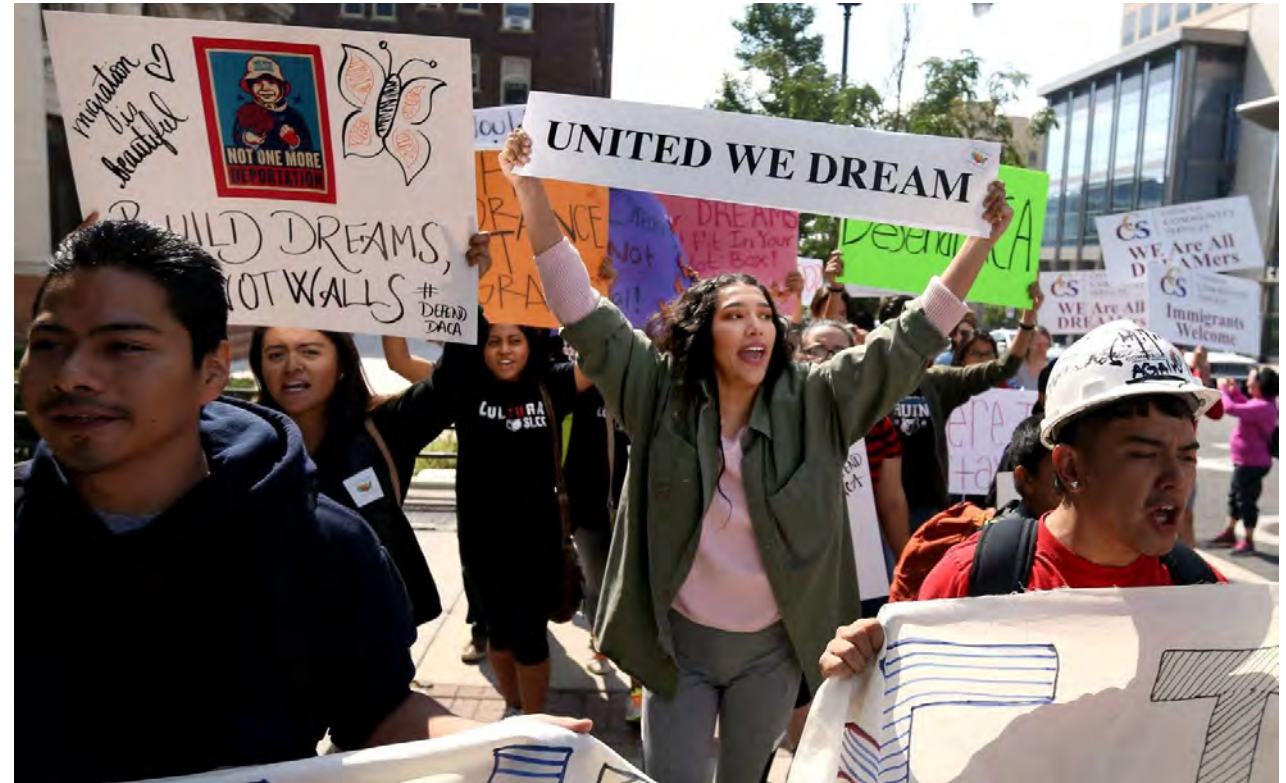
“We Are All DREAMers” rally in Salt Lake City on Sept. 16, 2017

“We will collaborate with our colleges and universities and K-12 partners to expand dedicated resources and streamline processes, including but not limited to admissions and enrollment, that support Dreamers, undocumented, and DACA-eligible individuals.”