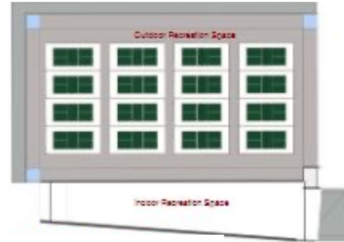
Recreational Field Level Plan