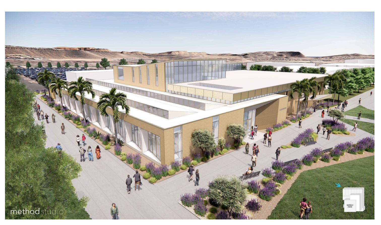
Northwest corner rendering