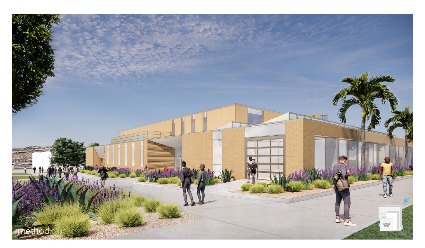
Northwest corner rendering