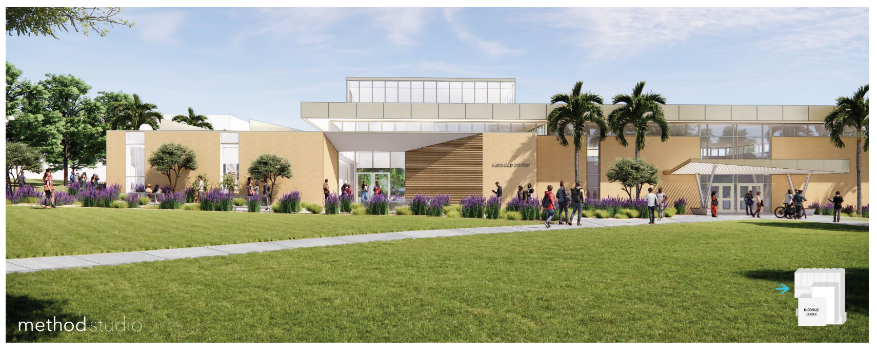
Encampment Mall rendering