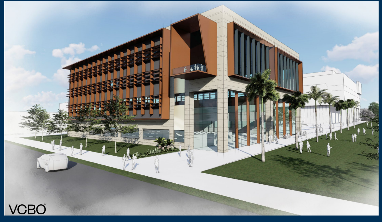
Southeast corner rendering