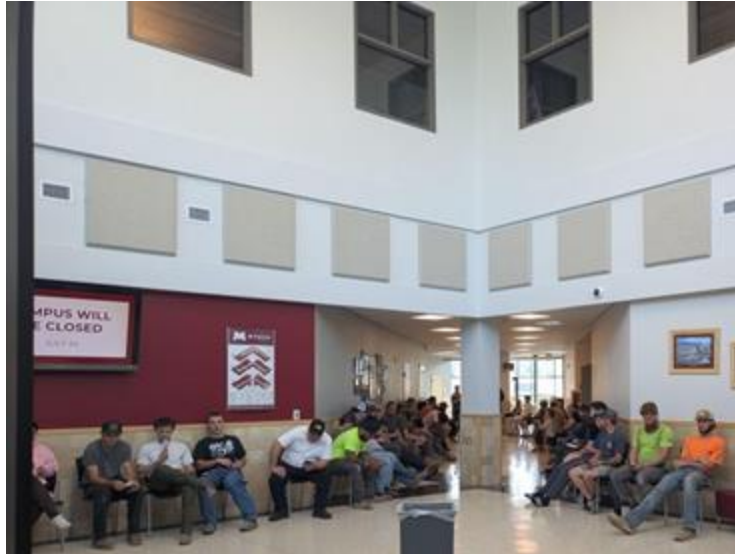
Current MTECH Waitlist*