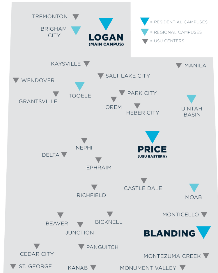
Map of Utah State University locations. Not all sites are separate campuses.

Statistical tables are broken out by statewide campuses. The first three are USU’s residential campuses (Logan, Eastern, and Blanding). Several additional statewide campuses have a building and facility owned by USU, but most are a room or classroom to serve a population in rural Utah.